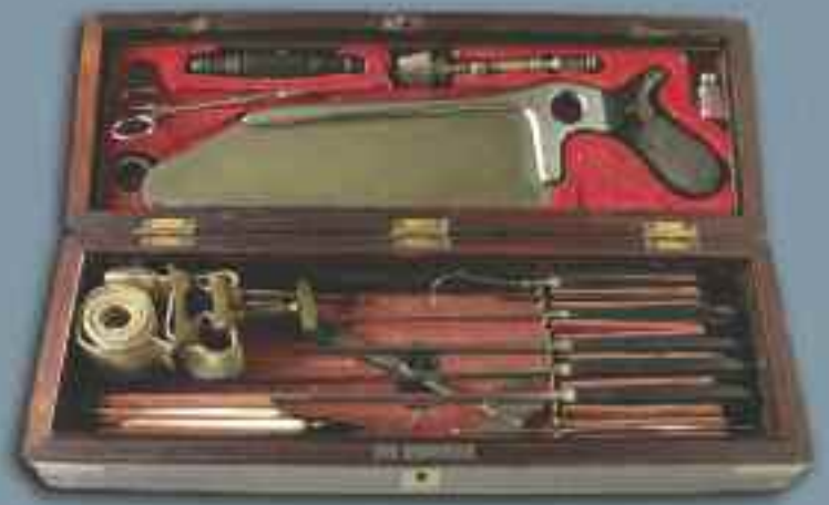
Over 150,000 African-American troops (right) eventually served the Union cause, and many faced medical treatment along with doctors using a typical surgical kit like the one pictured above.

T he Civil War is the defining event in American history since the founding of our Republic. Many of us have studied its history, battles, tactics and strategy; some have delved into the fundamental causes and the dominant political, economic and human right issues. However, we cannot truly comprehend the magnitude and impact of the Civil War era unless we take time to understand the bravery and sacrifices, individually and collectively, of those who fought on both sides, and all whose lives that were indelibly shaped and affected before, during and in the aftermath of this epic struggle. To this day, we still live with the legacy, outcome and consequences of the Civil War.